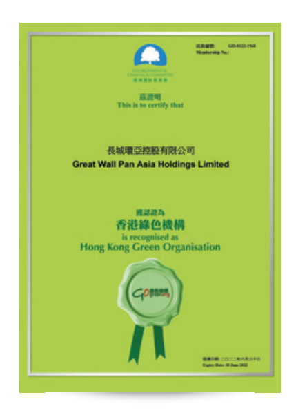
Hong Kong Green Organisation Certificate 「香港綠色機構」證書

報告期內,本公司再次蟬聯由環境運動委員會聯 同10個機構如環境保護署、香港社會服務聯會、 商會及其他組織合辦的「香港綠色機構」名銜及標 誌。我們相信,伴隨著實施優秀的環境管理及我 們員工的參與,本公司在可持續發展方面做出的 努力將會得到更多認可。同時,我們獲得由環境 運動委員會頒發的「香港綠色機構認證-節能證 書」以及「香港綠色機構認證-減廢證書,彰顯了 對本公司於綠色節能方面表現的肯定。