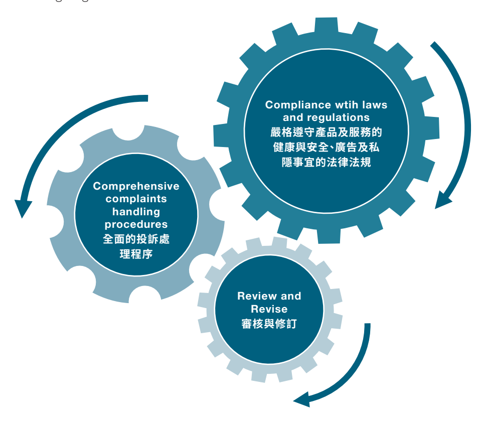
Service Quality Approach 服務質量方法

本公司制定並實施《合規手冊》、《有關僱員進行證 券交易的標準守則》等內部政策,並於報告期內 修訂完善了持牌公司的《營運及合規手冊》,從諸 多方面保證我們的服務質量,履行我們的企業責 任。我們保證服務質量的流程如下圖所示: