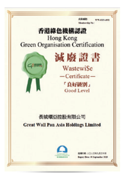
Hong Kong Green Organisation Certificate -Wastewi$e Certificate 「香港綠色機構」一 減廢證書