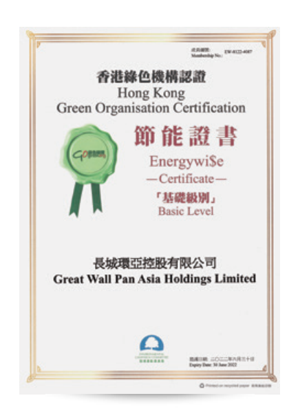
Hong Kong Green Organisation Certificate -Energywi$e Certificate 「香港綠色機構」-節能證書