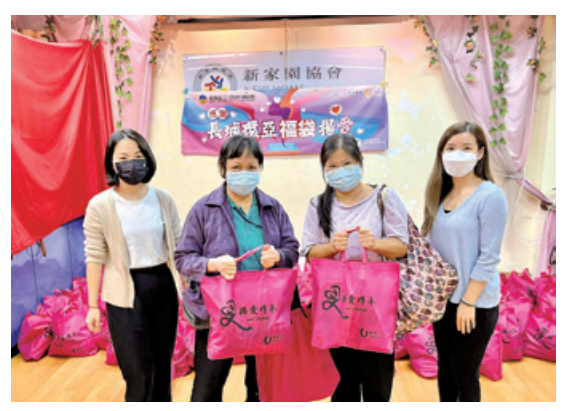
U-hearts Support Program 「兩地一心」志願活動