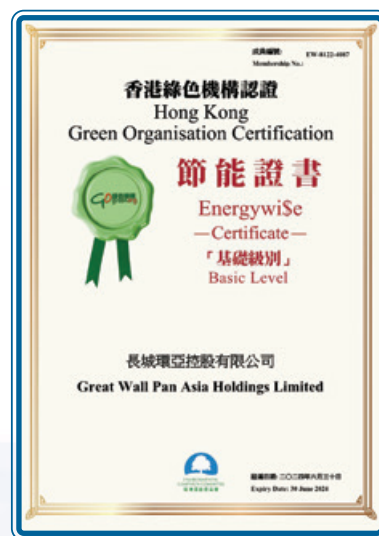
“Hong Kong Green Organisation Certification – Energywi$e Certificate” (Basic Level) 「香港綠色機構」—節能證書 (基礎級別)