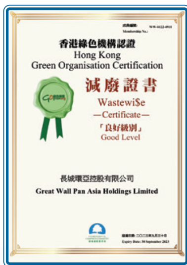
“Hong Kong Green Organisation Certification – Wastewi$e Certificate” (Good Level) 「香港綠色機構」—減廢證書 (良好級別)