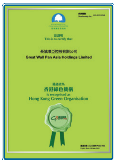
“Hong Kong Green Organisation” Certification 「香港綠色機構」證書

本集團再次獲得由環境運動委員會聯同環境保護署、香港社會服務聯會、商會等多個機構合辦的「香港綠色機構」名銜及標誌。我們深信透過實施卓越的環境管理措施及員工的參與，本集團在可持續發展方面的努力必將獲得進一步的認可。同時，我們亦獲得環境運動委員會頒發的「香港綠色機構認證—節能證書」及「香港綠色機構認證—減廢證書」，這不僅是對我們在節能和減廢方面努力的認可，也是對本集團在綠色可持續實踐方面成效的明確肯定。